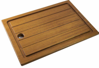
Iroko-wood chopping board 8643 117