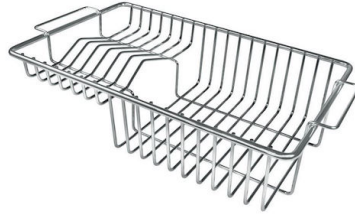
Stainless steel plate rack 8100 305